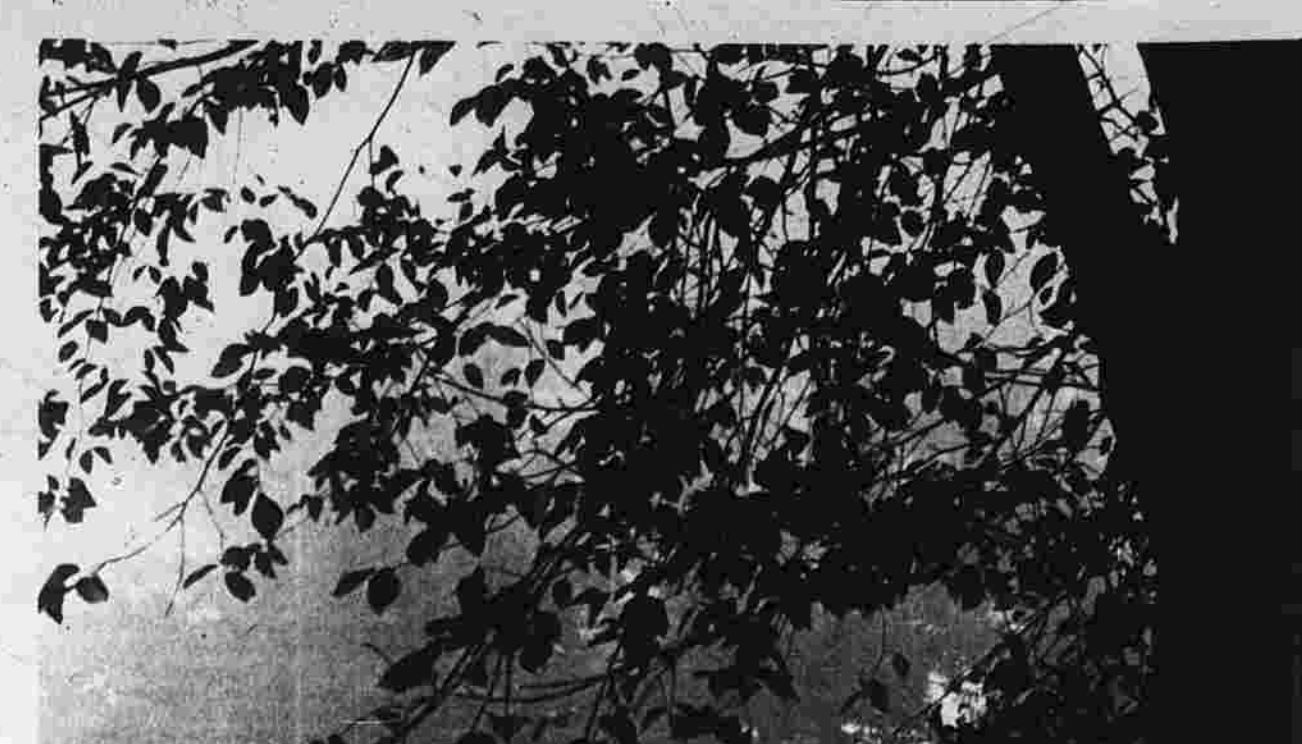
SEPTEMBER MORN, CENTER PARK

Then he delivered himself of the quipry designed to gain a moment of oratorical immortality for one Robert Moses. "Dependence on numbers as such," said Mr. Moses, "is the curse of modern communication. Numbers do not discover and invest in the arts, sciences,