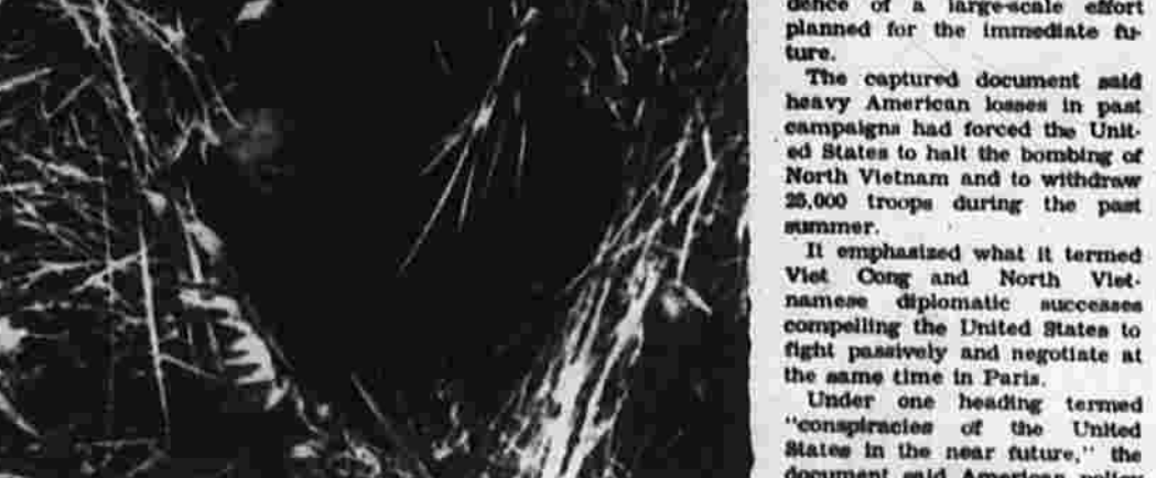
Two U.S. paratroopers of the 82nd Airborne Division rest in the reeds of a swampy area of South Vietnam. The men had been on a search operation.